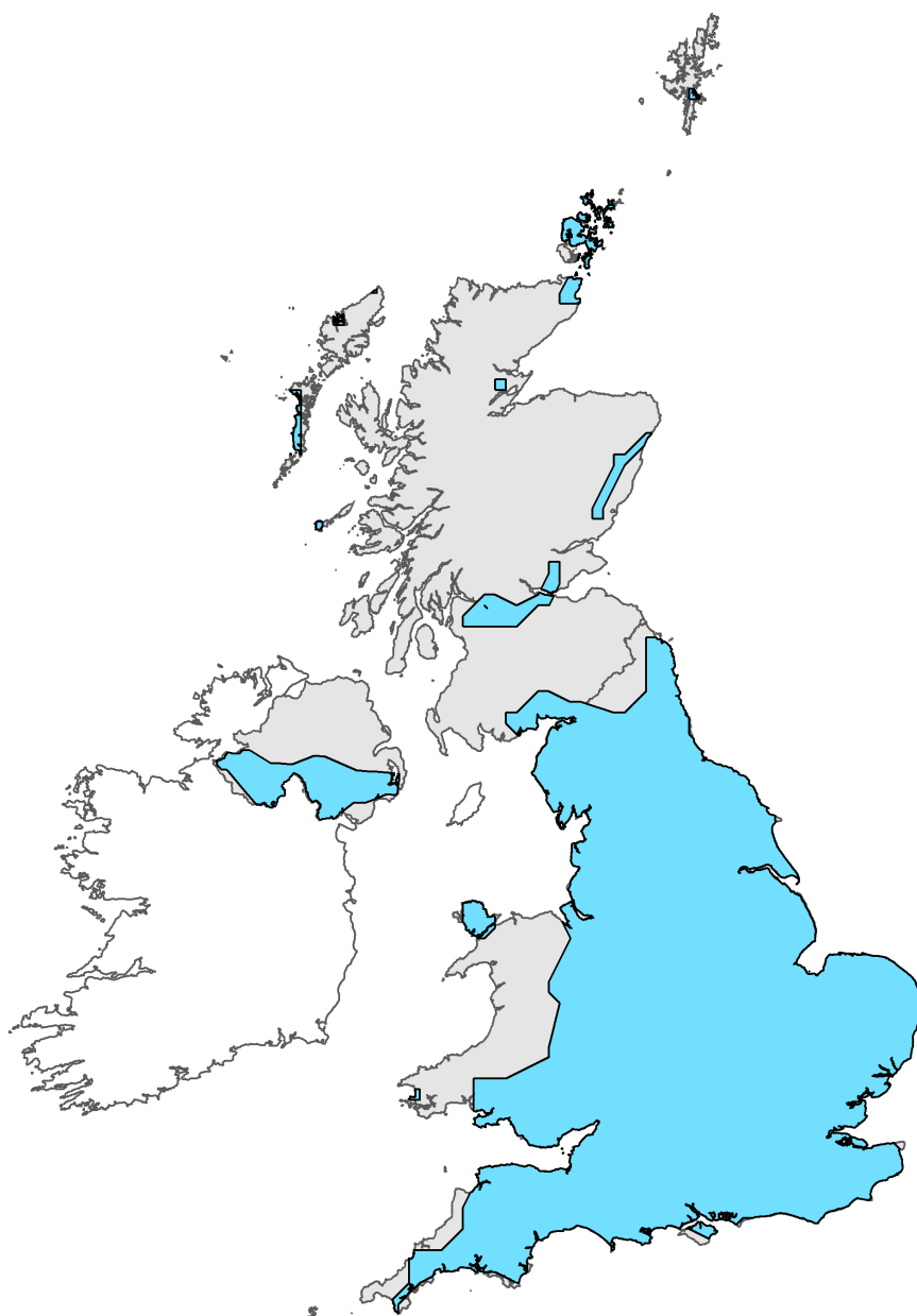
Figure 2: UK range map for H3150 - Natural eutrophic lakes with Magnopotamion or Hydrocharition -type vegetation. Coastline boundary derived from the Oil and Gas Authority's OGA and Lloyd's Register SNS Regional Geological Maps (Open Source). Open Government Licence v3 (OGL). Contains data © 2017 Oil and Gas Authority.

The range map has been produced by applying a bespoke range mapping tool for Article 17 reporting (produced by JNCC) to the 10km grid square distribution map presented in Figure 1. The alpha value for this habitat was 25km. For further details see the 2019 Article 17 UK Approach document.