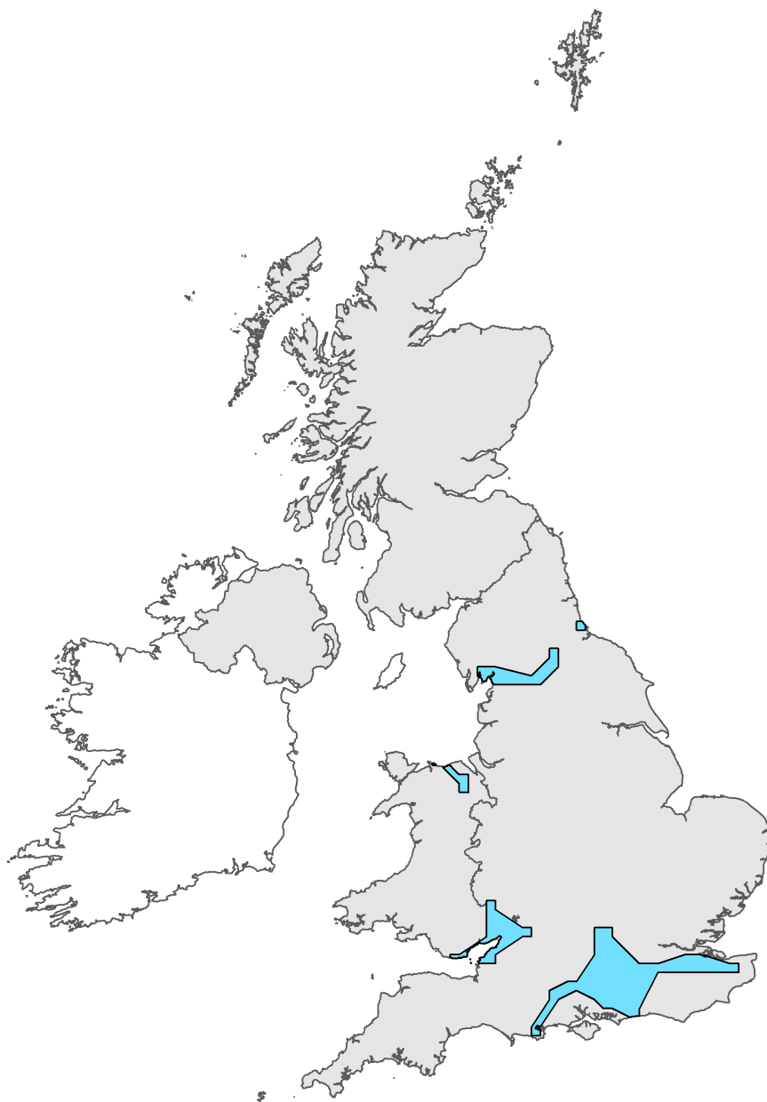
Figure 2: UK range map for H91J0 - Taxus baccata woods of the British Isles. Coastline boundary derived from the Oil and Gas Authority's OGA and Lloyd's Register SNS Regional Geological Maps (Open Source). Open Government Licence v3 (OGL). Contains data © 2017 Oil and Gas Authority.

The range map has been produced by applying a bespoke range mapping tool for Article 17 reporting (produced by JNCC) to the 10km grid square distribution map presented in Figure 1. The alpha value for this habitat was 25km. For further details see the 2019 Article 17 UK Approach document.