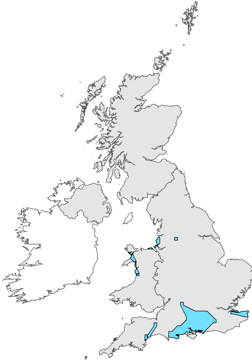
Figure 2: UK range map for S1261 - Sand lizard ( Lacerta agilis ). Coastline boundary derived from the Oil and Gas Authority's OGA and Lloyd's Register SNS Regional Geological Maps (Open Source). Open Government Licence v3 (OGL). Contains data © 2017 Oil and Gas Authority.

The range map has been produced by applying a bespoke range mapping tool for Article 17 reporting (produced by JNCC) to the 10km grid square distribution map presented in Figure 1. The alpha value for this species was 25km. For further details see the 2019 Article 17 UK Approach document.