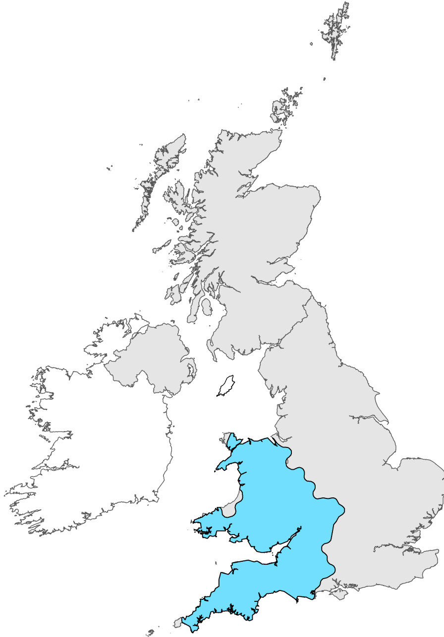
Figure 2: UK range map for S1303 - Lesser horseshoe bat ( Rhinolophus hipposideros ). Coastline boundary derived from the Oil and Gas Authority's OGA and Lloyd's Register SNS Regional Geological Maps (Open Source). Open Government Licence v3 (OGL). Contains data © 2017 Oil and Gas Authority.

The range map has been produced by The Mammal Society applying a range mapping tool as outlined in Matthews et al. (2018), to the 10km grid square distribution map presented in Figure 1. The alpha value for this species was 20km. For further details see the 2019 Article 17 UK Approach document.