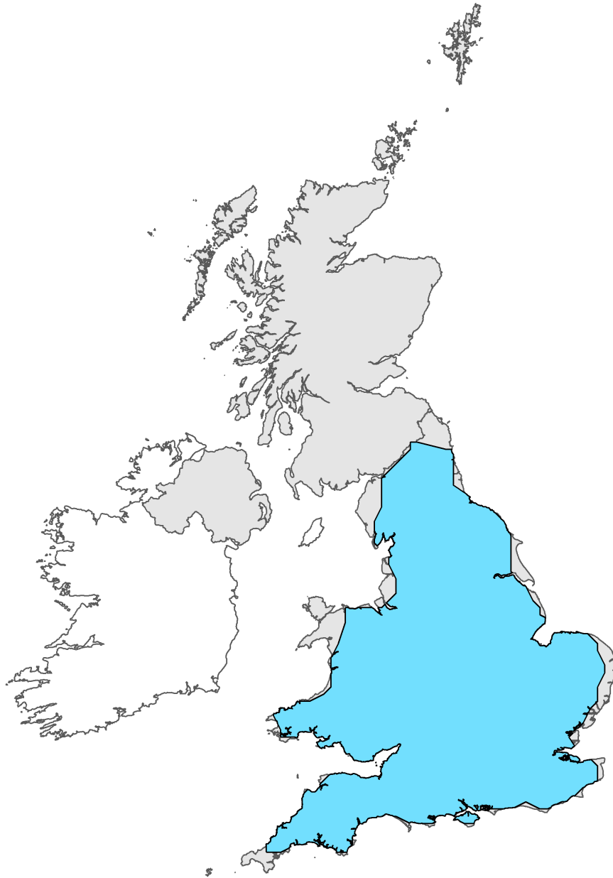
Figure 2: UK range map for S6965 - Bullhead ( Cottus gobio ). Coastline boundary derived from the Oil and Gas Authority's OGA and Lloyd's Register SNS Regional Geological Maps (Open Source). Open Government Licence v3 (OGL). Contains data © 2017 Oil and Gas Authority.

The range map has been produced by applying a bespoke range mapping tool for Article 17 reporting (produced by JNCC) to the 10km grid square distribution map presented in Figure 1. The alpha value for this species was 25km. For further details see the 2019 Article 17 UK Approach document.